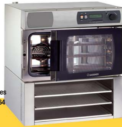
Shelves ET 3.64