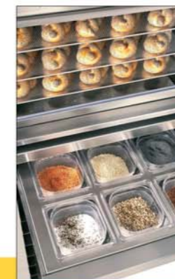
Ingredient drawer with 6 containers