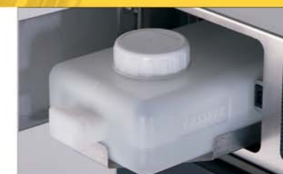
Integrated water tank in a drawer

*The special colours refer to the front glass