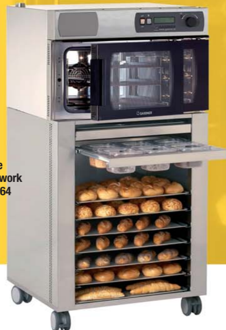
Mobile framework FUL 7.64