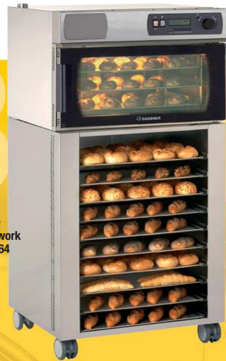
Mobile framework FU 10.64

backmax easy to clean easy maintenance hot air baker's oven with clean lines for baking oven fresh rolls