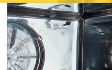
Hygienic oven interior