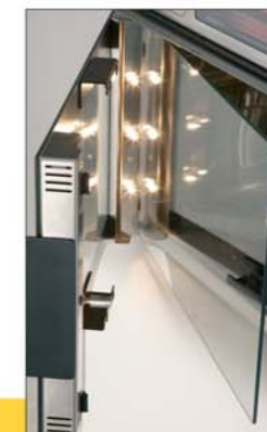
Easy to change halogen lighting